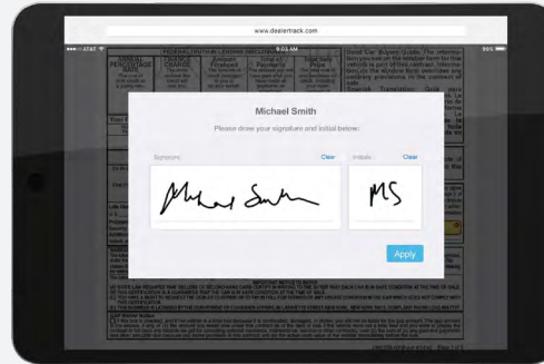
2. eSign Electronic signing on verified contract