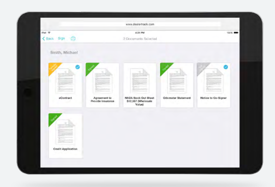
3. eSubmit Submit electronically (no overnight shipping)