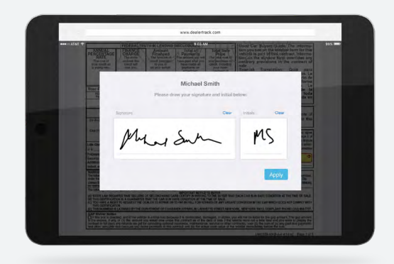
2. eSign Electronic signing on verified contract